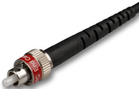
3mm Fiber with FC-APC connector and end cap

Polarization-maintaining, endlessly single-mode, photonic crystal fibers series PCF-P with Gaussian intensity profile